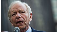
Lieberman: Dems won't win with slide to left