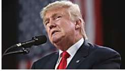
Trump worried about keeping phone at WH