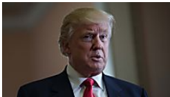
Poll: Majority of voters want Trump to delete