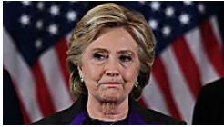
Clinton to attend Capitol Hill event honoring Reid